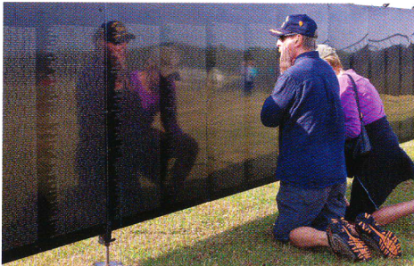
"Oh My God, There's His Name!"