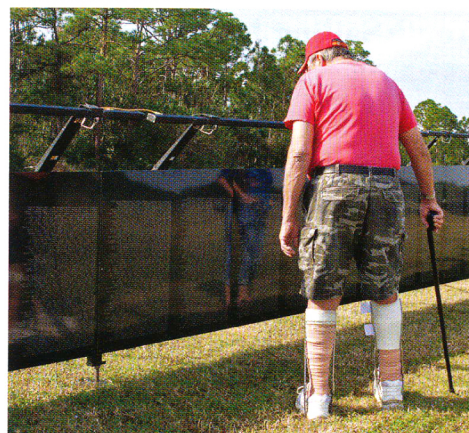
"All Gave Some"