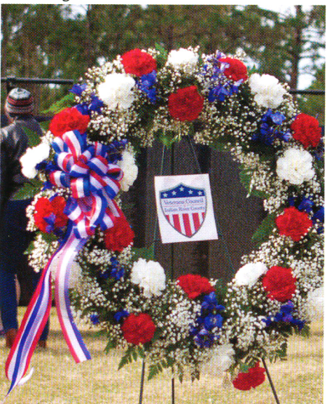
"58,315 Gave All"

A traveling replica of the Vietnam Veterans Memorial arrived in Vero Beach with local motorcycle clubs and law enforcement as its escort, much to the honor of the fallen heroes whose names cover the wall.