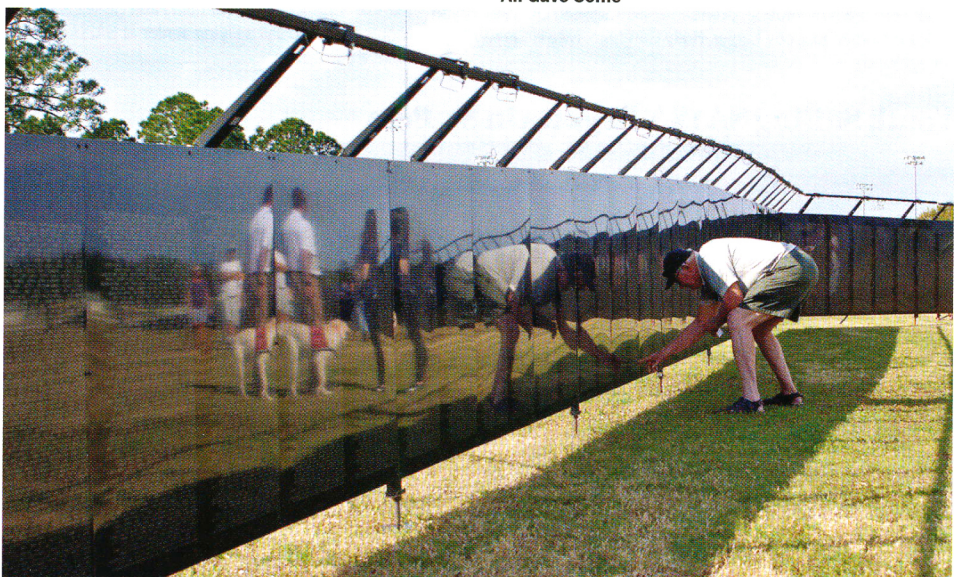
"It Helps To Touch Their Name"